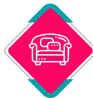
Household Items & Furniture