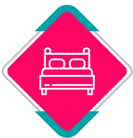
Bed & Linen